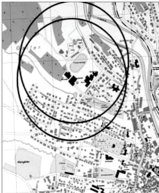
Fig. 1: Schematic plan of the antenna sites

The GSM transmitter antenna has a power of 15 dBW per channel in the 935MHz frequency range. The total